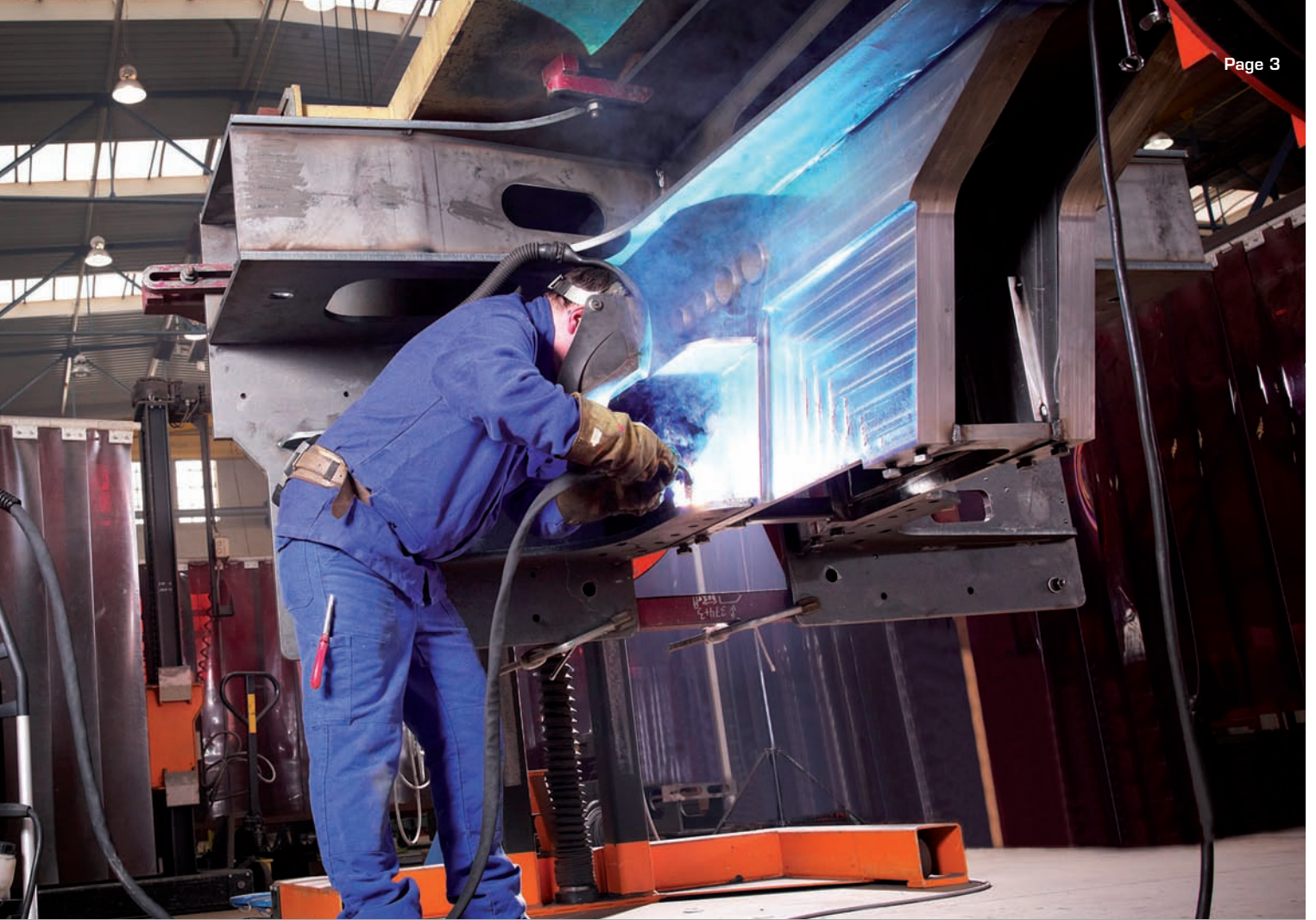
/ Perfect welding using forceArc® on a head piece for locomotives used for heavy-duty goods transport.