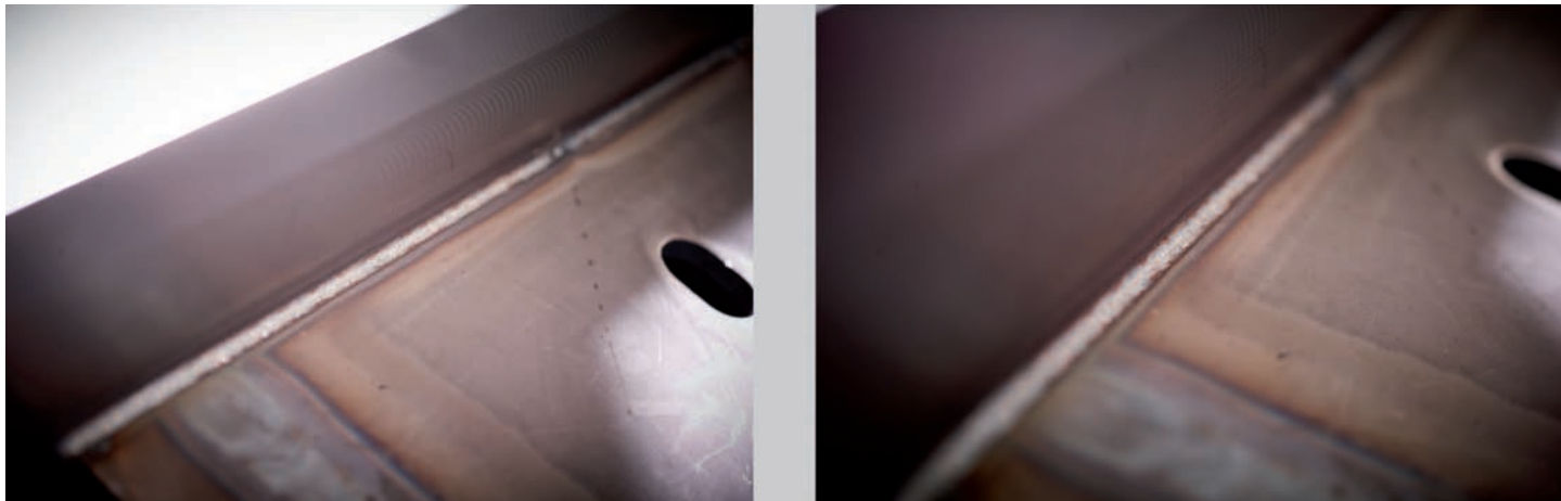
/ Nearly spatter-free seams ensure the utmost in quality. Consequently, this means welding consumables savings and significantly reduced post weld work.