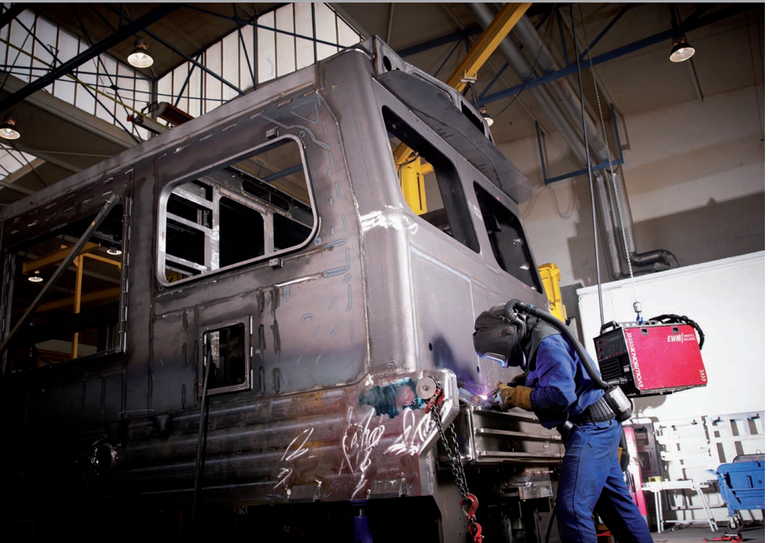
/ Efficient welding using forceArc® on a locomotive frame used for heavy-duty goods transport.