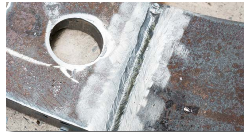
Reduction of the included angle from 60° to 40° uses less weld bead in forceArc® welding. This minimises the duration of welding and saves money.