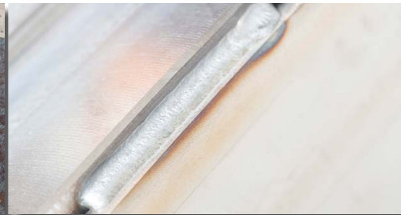
MAG-welded fillet weld in PB position is virtually spatter-free.

coldArc and forceArc welding procedures are extremely different in application as are the parameters required for welding using the two procedures. forceArc welds are mainly used on thick structural steel welded using steel wire. CrNi steels, on the other hand, are welded using suitable welding consumables. The composition of the shielding gas used for the two procedures is also different.