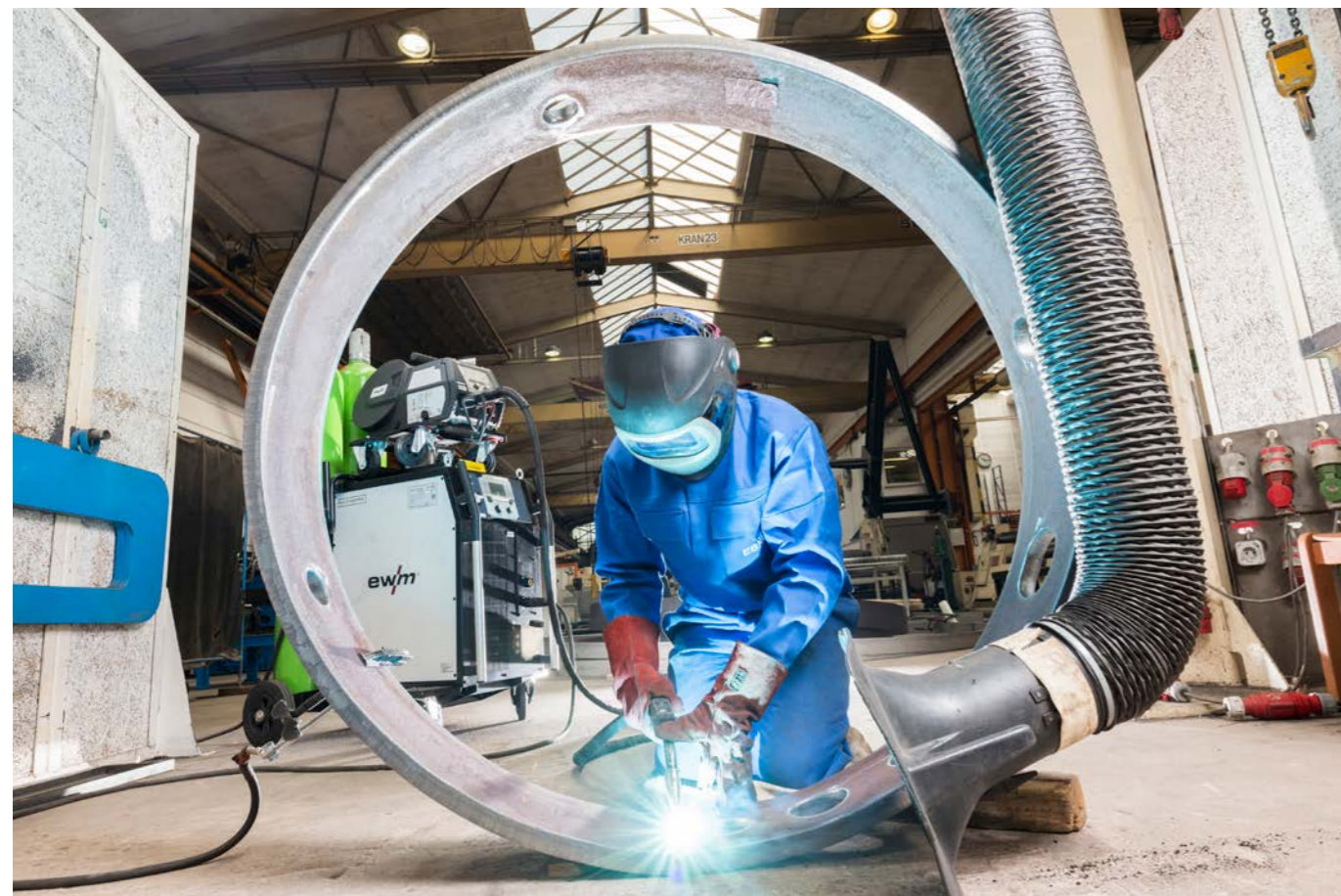
Welding a double V-butt weld on a steel ring using forceArc

machines themselves must be light and easy to push or pull along. However, the proviso that the welders must be able to complete their entire range of welding tasks using only one machine was even more significant. Meeting this demanding requirement was the pièce de résistance for EWM and gave our machines a clear competitive edge: As all innovative welding procedures are saved in our machines, a single device can weld especially thick materials, such as steel rings for load transfer, using forceArc and use coldArc to weld particularly thin CrNi steels, such as those used in nozzle casings.